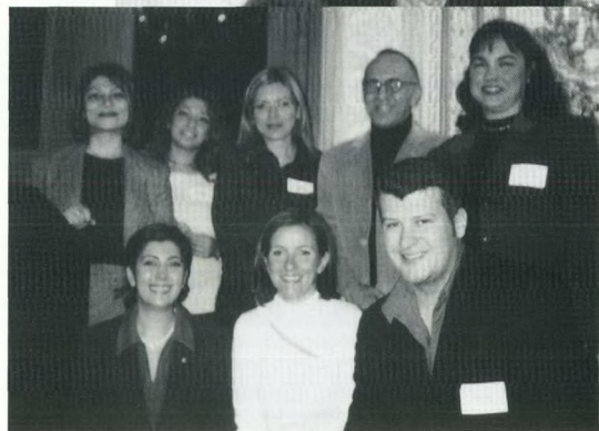
The Turkish alumni reception was held in January at the Ciragan Palace in Istanbul.