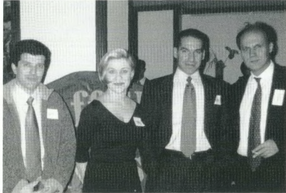
Suffolk hosted two alumni receptions in Greece in January. The Athens reception was held at the NJV Athens Plaza Hotel and the Thessoloniki alumni reception was held at the Macedonia Palace Hotel.