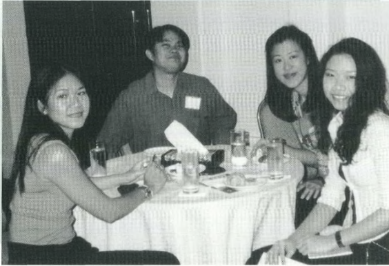
The Thailand alumni reception was held in March at The Regent, Bangkok.