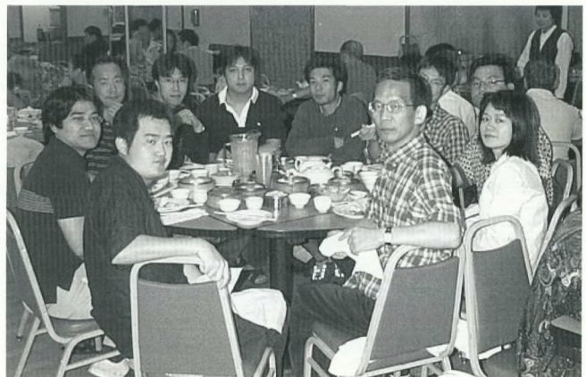
In August, Japanese graduate students welcomed incoming Japanese students with a luncheon held in Chinatown, Boston.