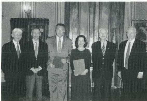
Suffolk University and Istanbul University recently signed an academic cooperation and exchange agreement.