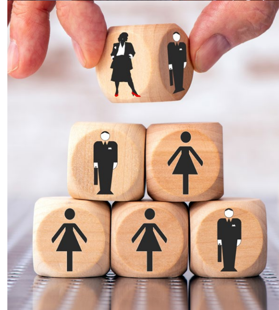
Until now, little attention has been paid to employees' perceptions of female managers' leadership styles.

research tests which use word association to check unconscious bias—and a survey that investigated the impact of gender stereotype on the perceived emotional leadership of front-line hospitality employees.