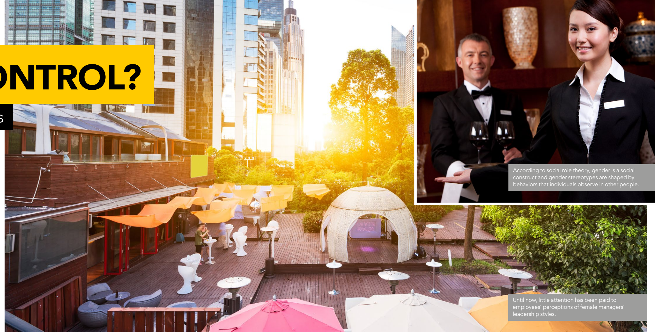
According to social role theory, gender is a social construct and gender stereotypes are shaped by behaviors that individuals observe in other people.

Three independent but complementary studies were conducted for the research. These comprised two 'implicit association tests'—widely-used, computer-based classical