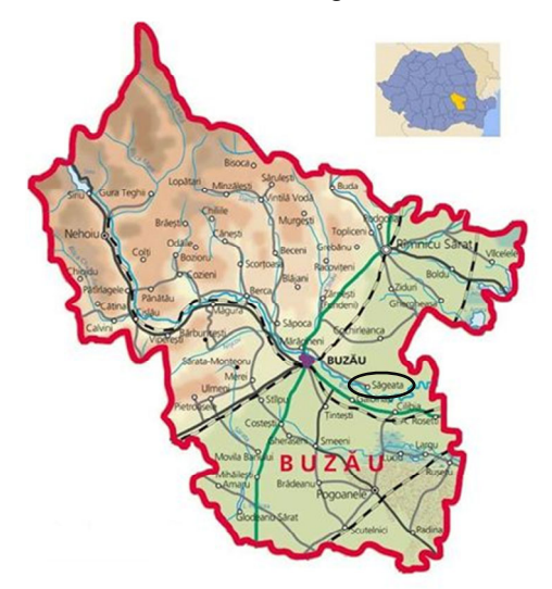
Figure 1 - Geographical location of the region – Buzau County, Romania

The entire flock of sheep on each farm was examined every month during the study period to assess the seasonal incidence of the disease. Sick animals were isolated from healthy animals and kept on clean, dry and constantly changed bedding. Samples were taken from the affected limbs of sheep with severe lesions for bacteriological examination.