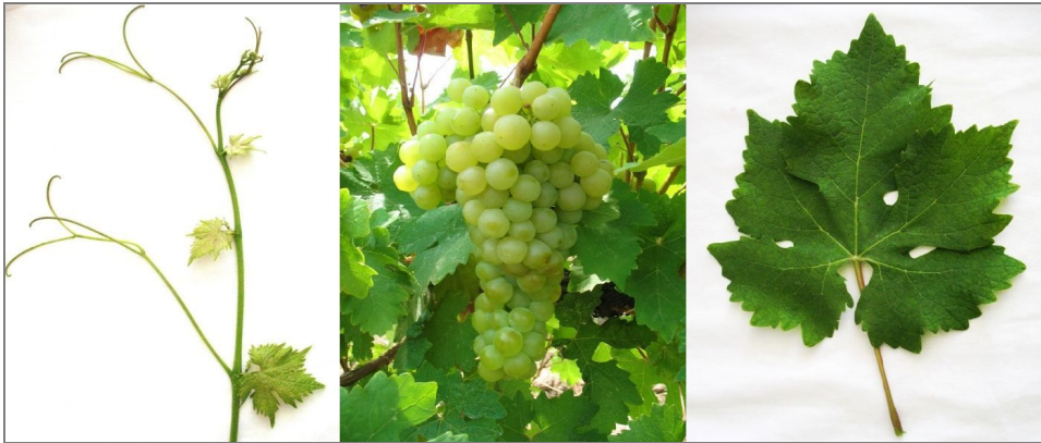
Figure 3 - 'Șarba' (shoot tip, grape, adult leaf)