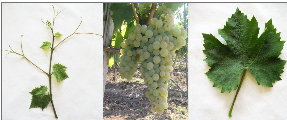
Figure 5 - 'Miorița' (shoot tip, grape, adult leaf)