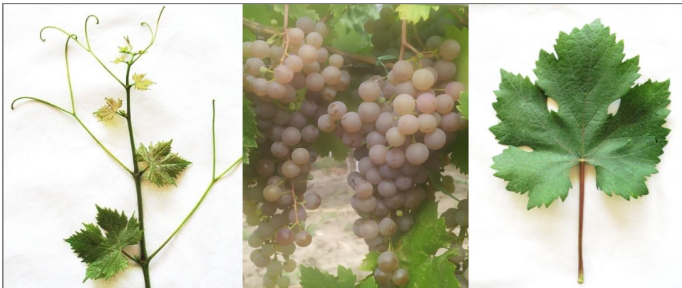
Figure 4 - 'Băbească gri' (shoot tip, grape, adult leaf)