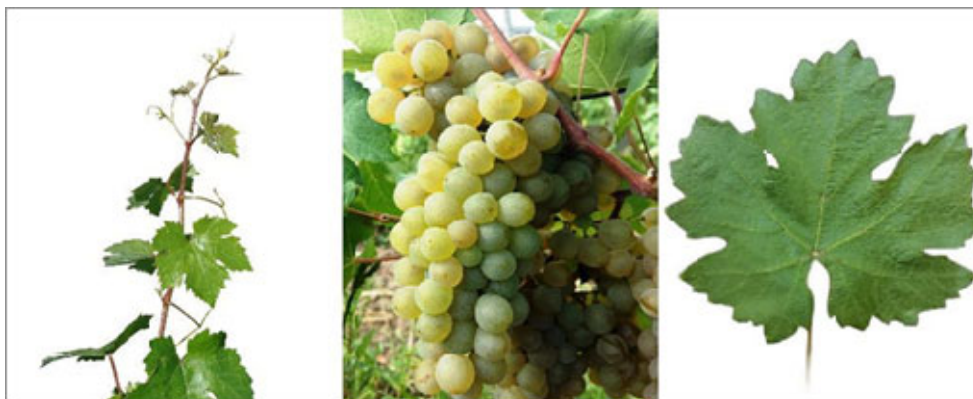
Figure 6 - 'Vrancea' (shoot tip, grape, adult leaf)

The control variety was 'Sauvignon Blanc', grown on large areas in the Odobești Vineyard.