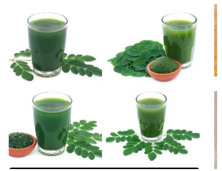
Figure 2. Making Moringa Tea Special

The socialization of Moringa was aimed at Citali villagers to get to know more about Moringa and change their mindset with Moringa being attached to mystical things and the many benefits of Moringa. And they were also demonstrating how to make processed moringa products, namely Moringa drinks.