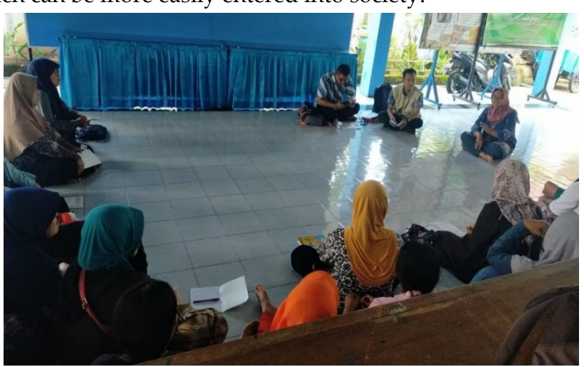
Figure 4. Coordination of UMKM Bazaar Preparations

Making films related to Moringa, but the scenes are still close to residents' habits, so our approach can be more easily entered into society.