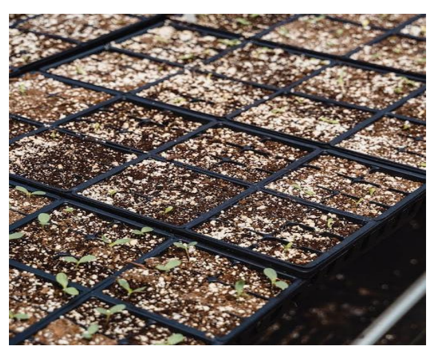
Figure 1. Moringa Nurseries This planting and nursery created a color village in Citali Village.