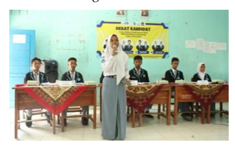
Figure 2. Student Council President Candidate Debate Activities (Democratic Voice Theme)

Office, all high school principals in Pringsewu Regency, Student Council administrators in Pringsewu Regency, and parents of students. The following is the work of the students at Bina Mulya High School: