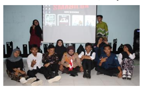
Figure 4. Film Appearance (Theme Build Soul and Body)

However, in the implementation of the P5 Project, some problems still become obstacles, but on the other hand, the Project implemented in the school has advantages. The shortcomings still found are problems regarding the efficiency of Class Hour (JP) time in each theme; besides that, there is a need for improvement again regarding the P5 Project. Still, on the other hand, it also has advantages because Bina Mulya High School is a Mobilization School that related parties have more intensively guided, besides that school residents have also carried out their duties optimally so that the projects displayed are very creative and innovative so that the objectives from the Strengthening the Profile of Pancasila Students (P5) project at Bina Mulya High School can be fulfilled.