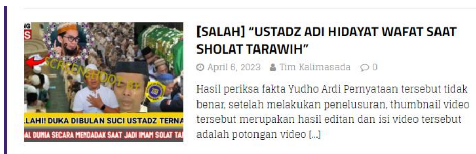
Gambar 2. [Hoax] Ustadz Adi Hidayat wafat saat sholat tarawih.

Another post on the MAFINDO website asserted that Ustadz Adi Hidayat died during the tarawih prayer (Kalimasada, n.d.-c). On April 6, 2023, a video titled "Trend 7 Official" was uploaded to YouTube, claiming that Ustadz Adi Hidayat died during the tarawih prayer. Nonetheless, further investigation revealed that the video had been altered. The video's thumbnail had been altered, and its content contained excerpts from extraneous events that did not involve Ustadz Adi Hidayat.