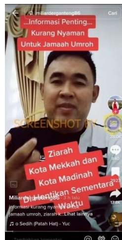
Picture 4. The MAFINDO website reported that there was a hoax circulating about the temporary suspension of the pilgrimage in Mecca and Medina

Frequently, the aforementioned fake news is designed to deceive or mislead others. In the context of proselytizing, it is therefore essential to prioritize transparency in communication. As Muslims, we endeavor to maintain integrity and openness in our interactions. Transparency in da'wah is crucial for building trust between the preacher and the audience. People are more likely to believe a message when it is conveyed by individuals who communicate honestly and openly because they feel valued, are listened to, and are more likely to believe the message. This transparency enhances the positive impact of da'wah by strengthening the bond between preachers and society. Transparency is essential in da'wah to prevent manipulation or deception. Preachers avoid manipulative strategies to influence beliefs or actions by embracing honesty and transparency. Transparency ensures that religious