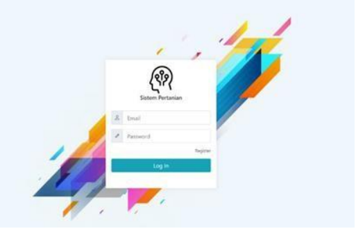
Figure 1. Log in Page Display

To log into an application usually as a user must input identity information as a user, user information using e-mail and password.