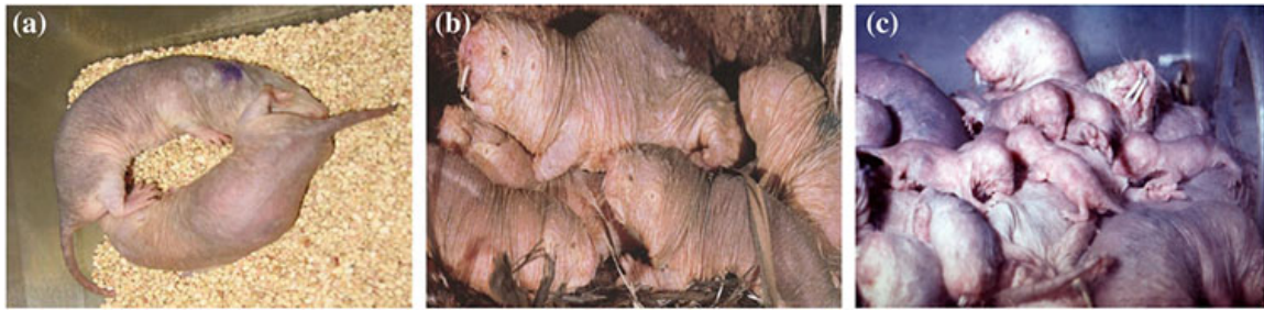
Fig. 1: a) Breeding mates. b) Breeders. c) Workers.