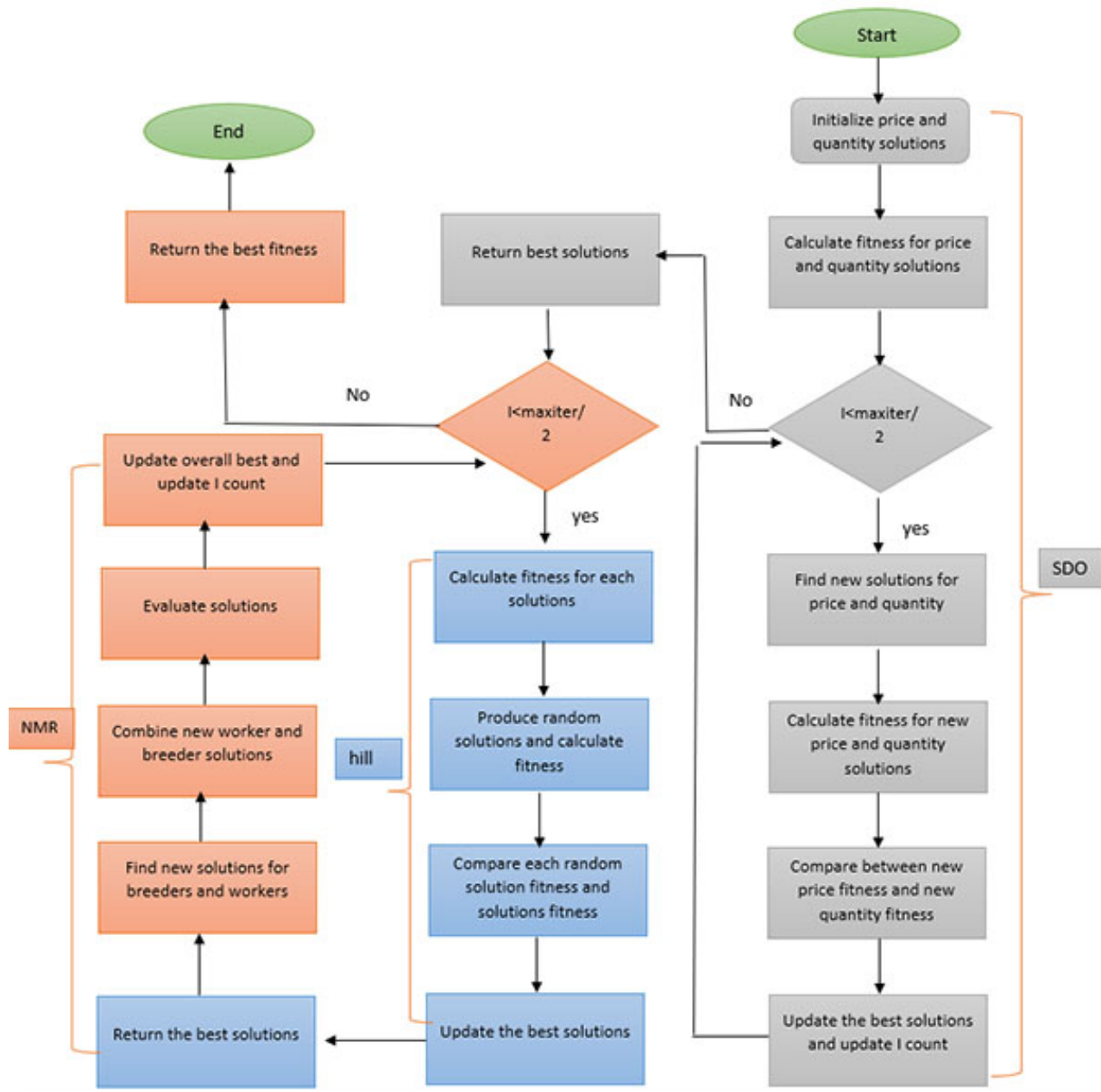
Fig. 3: The flowchart showcases the hybrid of two distinct metaheuristic models with a local search model.

algorithm's fitness computation. Comparative analysis of alternative optimization techniques. To verify the SDO-NMR-Hill algorithm's superiority, we tested some well-known optimization methods on all three datasets and compared the outcomes to those attained by the SDO-NMR-Hill algorithm. The algorithms which we have chosen for comparison: improved squirrel search algorithm (ISSA) [46], squirrel search algorithm (SSA) [47], artificial bee colony (ABC) [48], particle swarm optimization (PSO) [49], bat algorithm (BA) [50], grey wolf optimizer (GWO) [51], whale optimization algorithm (WOA) [52], grasshopper optimization algorithm (GOA) [53], sailfish optimizer algorithm (SFO) [54], Harris hawks optimization (HHO) [55], Atom search optimization (ASO) [56], Henry Gas Solubility Optimization (HGSO) [57], and Bird swarm optimization (BSA) [58].