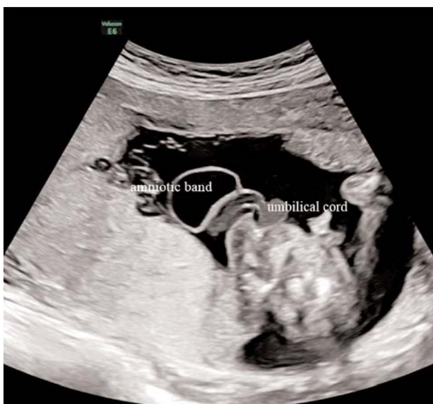
Fig. 1. An amniotic band was observed in close relation to the umbilical cord.

wrapped around the right upper extremity over the elbow. While the forearm and the hand at the distal of the constriction ring were edematous, hyperemia was observed at the proximal ( Fig. 3 ). The wrapped portion of the amniotic band was cut using endoscopic scissors (26159 SHW, Karl Storz, Tuttlingen, Germany) and grasper (26159 UHW, Karl Storz, Tuttlingen, Germany). On fetoscopic view, the extremity was floating freely following the procedure, and the umbilical cord was released ( Supplementary material: S-Video 1 ). The patient received tocolytic treatment and antibiotic prophylaxis before the procedure. On the postoperative second day, ultrasonographic examination showed the presence of distal blood flow at the right upper extremity and the reduction in the pre-operative edema. Furthermore, it was observed that the umbilical cord was freely floating in the amniotic cavity. The postoperative course was uneventful and the patient was discharged on the second day after the operation. Then, the patient was followed at two-week intervals. At 36 weeks of gestation, a 2300 g baby with Apgar score 5/10 was delivered via Cesarean section, with the indication of premature rupture of membrane and failed induction of labor. On neonatal examination, a skin lesion resulting from the constriction ring was found slightly over the elbow level