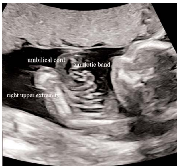
Fig. 2. The presence of an amniotic band in close relation to the edematous right upper extremity.