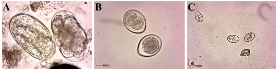
Figure 2. Visual presentation of various parasitic forms revealed with centrifugal faecal flotation method. A -trichostrongyle eggs; B -coccidian oocysts; C - Sarcocystis spp. oocysts.

Further on, centrifugal fecal flotation revealed other parasitic forms as a side finding in seven out of 52 inspected fecal samples. These were identified as: trichostrongyle and oxyurid eggs in a southern three-banded armadillo ( Tolypeutes matacus ); trichostrongyle eggs and coccidian oocysts in four red kangaroos ( Macropus rufus ); coccidian oocysts in one parma wallaby ( Macropus parma ); Sarcocystis spp. oocysts in one arctic wolf ( Canis lupus arctos ) (Table 2, Figure 2).