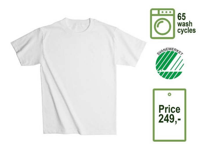
Appendix 3c: Product 3