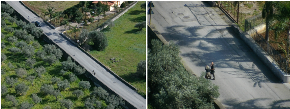
Fig. 3. Images acquired with no (left) and 30x zoom (right).

though with reduced performances due to both a lack of optical zoom and a lower resolution of the detector.