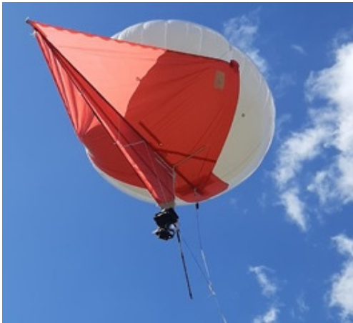
Fig. 1. Skyhook tethered Helikite.

tinuous and synoptic monitoring of vast areas of territory. This system allows continuous monitoring for long periods (months), with a greater level of spatial detail, which can be managed independently by the user according to their needs and with greater variety of data acquired. Other advantages are the improved time to costs ratio and no acoustic emissions. Furthermore, from the bureaucratic side, no licenses are required, just a clearance by the competent authority (NOTAM ENAC/ENAV ATM-05A). Moreover, it is easy to handle because it does not need an expert pilot.