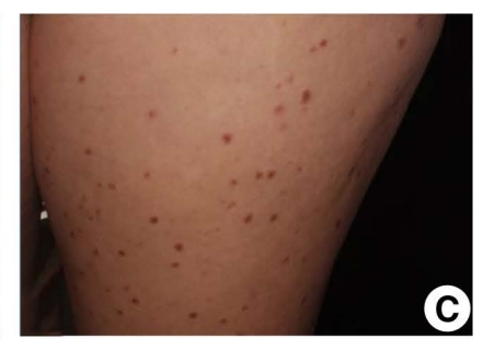
Figure 1. Multiple erythematous pruritic reticular macules and patches on the patient's trunk (A) and lower extremities (B and C) consistent with cutaneous mastocytosis.