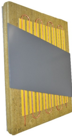
Sandwich element data for demonstrators (cf. Figure 1)