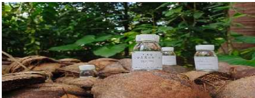
Figure 2. Bottled Virgin Coconut Oil Products

In sales activities, Virgin Coconut Oil (VCO) is packaged in bottles. As in the following figure 2: