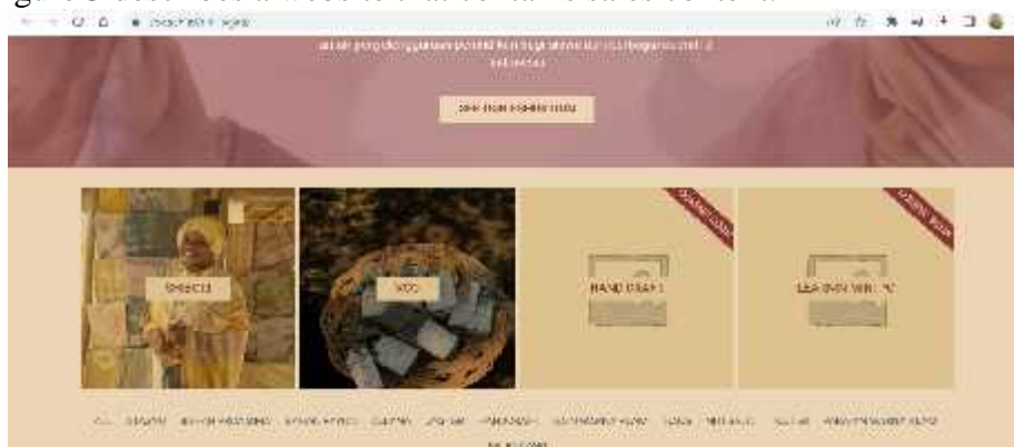
Figure 3. Sales Website

The selling price of Virgin Coconut Oil (VCO) with selected ingredients using community-sourced ingredients, namely coconut, which is the result of processing community gardens around the school, has a selling value of around IDR 15.000 - 25.000 per bottle. Furthermore, as a creative innovation, VCO is packaged in attractive packaging. In other words, prices that adjust are pocket-friendly are the main attraction for buyers. In addition, sales are made through technology and social media. Through the multimedia department, SMK Bakti Karya is considered successful in baiting student motivation and creativity in sales. Together with the entrepreneurship program under the Niti Sajati program, students create a sales link affiliated with the school's website, namely at https://www.sbk.sch.id/niti-sajati/ . The following figure 3 describes a website that contains sales content.