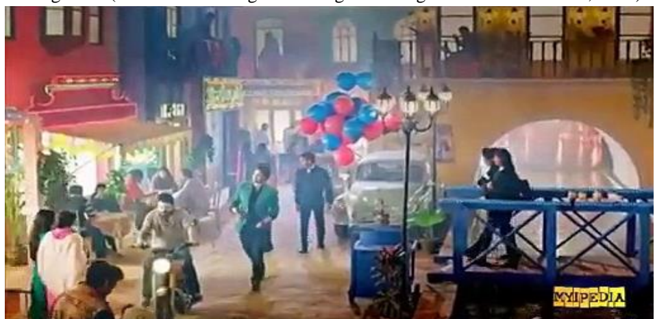
Figure 1. (Telenor is Making TV Ad Against Zong Mobilink and Ufone, 2016)