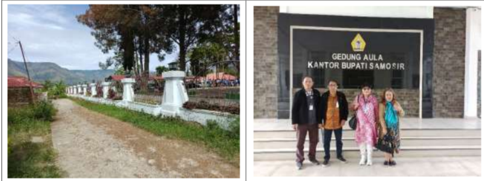
Figure 2. Heading to the Samosir Regency Regional Government Office

interviews with informants who were met during the activities.