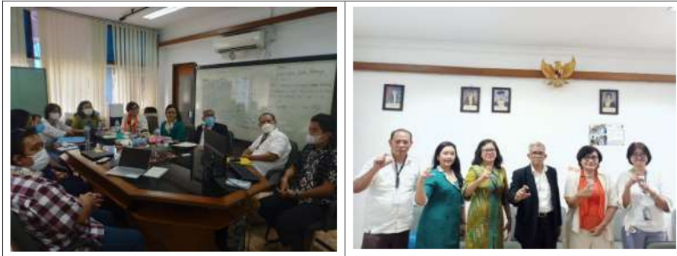
Figure 7. Discussion with the UNESCO Global Geopark Toba Caldera Management Body (Research and Development) with the Faculty of Economics and Business Universitas Kristen Indonesia

Development , I visited UKI to further discuss the Toba Caldera UNESCO Global Geopark and further enhance cooperation through a Memorandum of Understanding (MoU) , especially for research and community service activities.