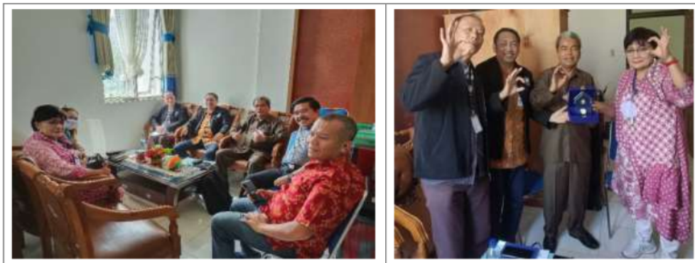
Figure 4. Discussion with the Unesco Global Geopark Toba Caldera Chairperson at the Regional Government Office of Samosir Regency, North Sumatra Province

support from the central, provincial, and private sectors, and c). Local cultural potential and regional biodiversity. Need to take advantage of strengths in using existing opportunities, namely: a). The existence of a geosite as UNESCO Geopark Global, b). Enthusiasm in tourism, and c) Stimulus for world tourism actors). All Regency Regional Governments to show more seriousness in following up on the results of meetings or meetings regarding inter-regional cooperation in the development of the Lake Toba Area.