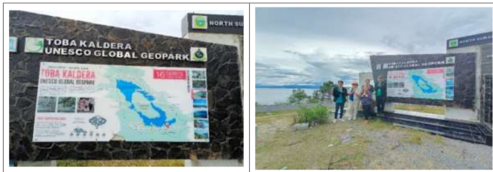
Figure 1. Tourism Area Bukit Singgolom is included in One Toba Caldera Unesco Global Geopark

cultural sites, and biodiversity on an ongoing basis. Unesco's recognition of the Toba Caldera as a UNESCO Global Geopark is early evidence of the awareness that Lake Toba needs to be developed by relying on the concepts of geodiversity , biodiversity , and cultural diversity . In this case, building Toba Lake is only sometimes for economic reasons. (Bangun & Junita, 2020)