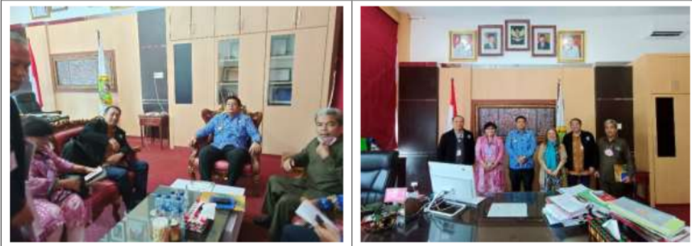
Figure 5. Discussion with the Regent of Samosir Regency with the Expert Team

that were only temporary but not sustainable.