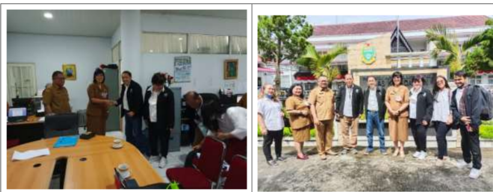
Figure 6. Discussion with the Tourism Office of North Sumatra Province

synergize to support each other and cover various shortages of funds. The provincial Government hopes that the Central Government will provide an adequate budget. Moreover, Toba Caldera is preparing for re-certification and revalidation from UNESCO to avoid being thrown from the UNESCO Global Geopark list. Because Lake Toba is still included in the UNESCO Global Geopark, it has a strategic impact and has become known worldwide.