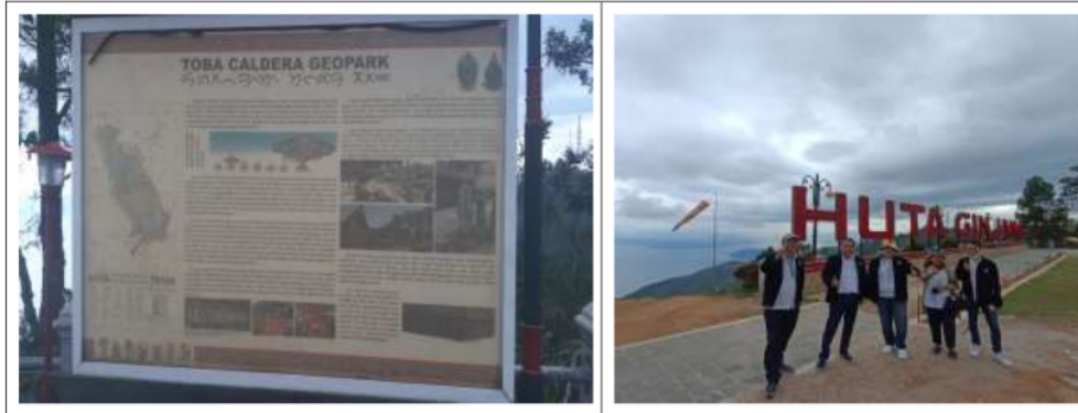
Figure 3. Tourism Area Huta Ginjang included Geopark is included in One Toba Caldera Unesco Global Geopark

Caldora, the Government and the local community are obliged to improve and maintain environmental sustainability and the integrity of the Toba Caldora Area." (KBRI in Paris, 2020).