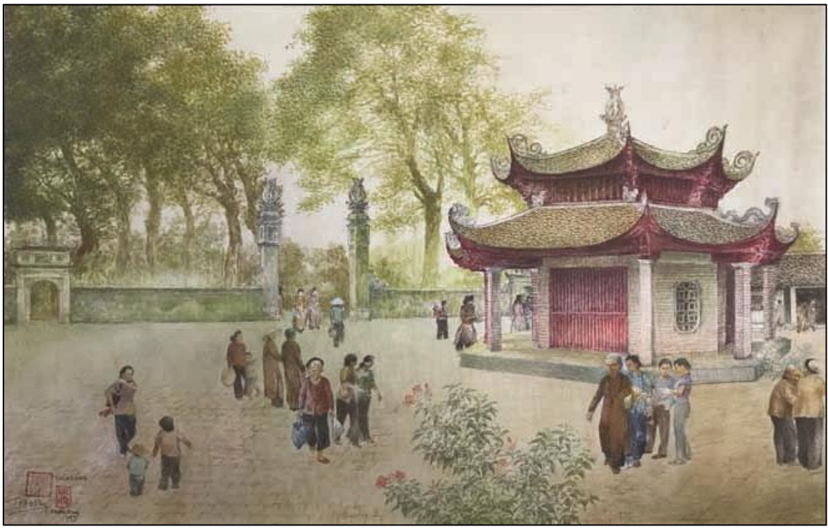
Figure 4: Painting "Phu Minh Pagoda" (Tran Duy, 1993), silk, 46cm x 68cm