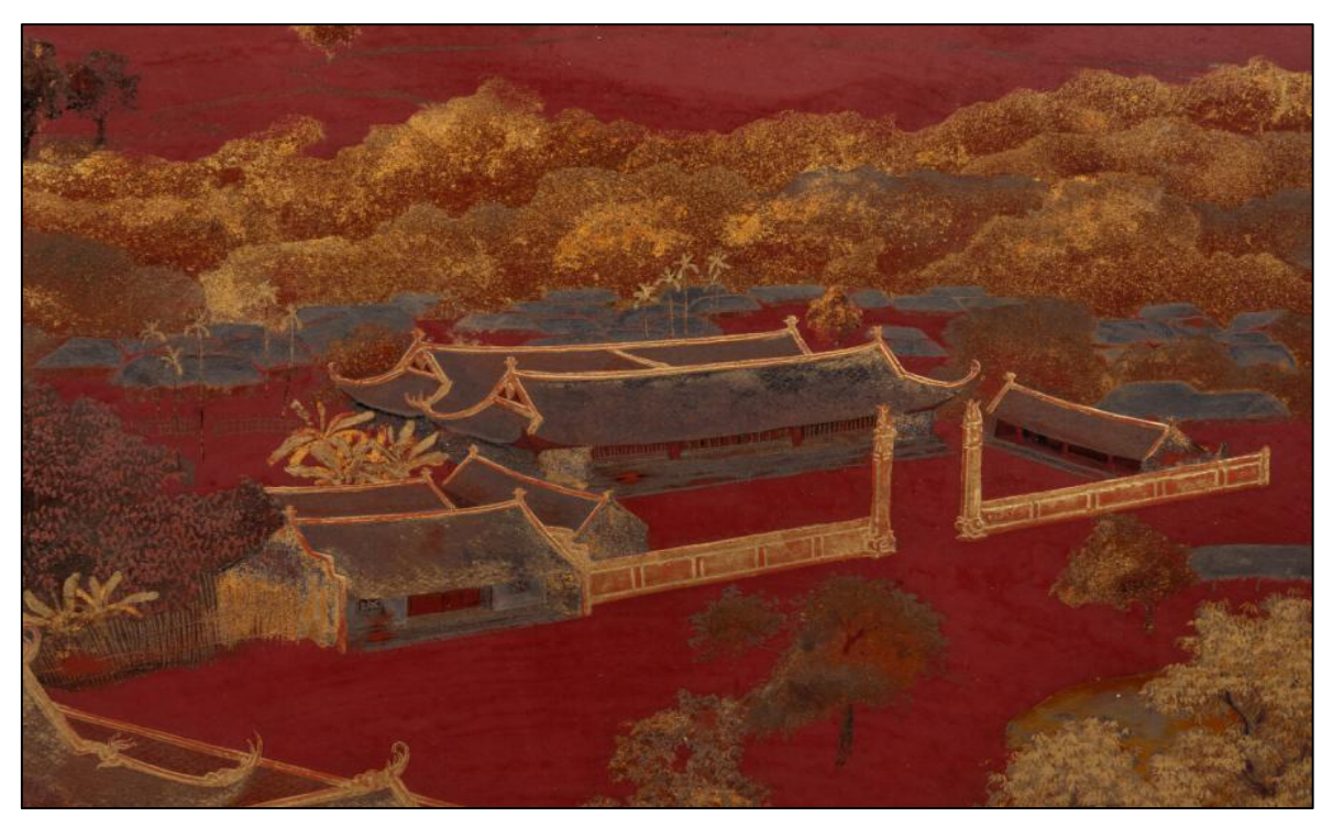
Figure 2: Painting "The scenery of Thay Pagoda" (Hoang Tich Chu, 1944), lacquer, 97cm x 196cm

The painting "Landscape of Thay Pagoda", one of the oldest Buddhist temples in Vietnam, with classical art. Painter Hoang Tich Chu also left us a lacquer painting depicting the temple hidden in the poetic and quiet mountain scenery. The work is currently kept at the Vietnam Fine Arts Museum.