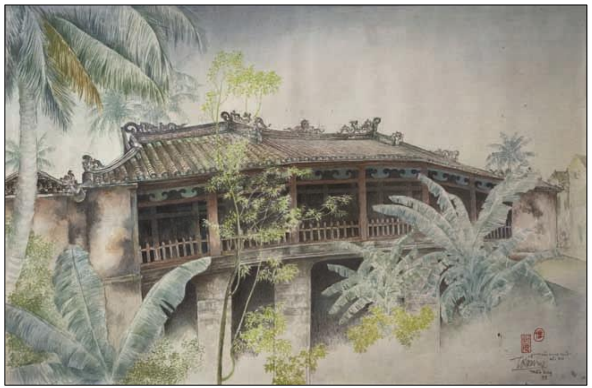
Figure 3: Painting "Nhat Cau Hoi An Pagoda" (Tran Duy, 1993), silk, 60cm x 80cm

With a meticulous and careful painting style, even the smallest detail, artist Tran Duy (1920-2014) produced many lyrical paintings of pagodas with soft silk. The writing style is rich in emotion, giving viewers another sense of the beauty of the Vietnamese temple.