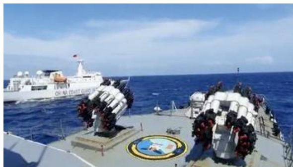
Figure 2. Chinese Coast Guard ships in the Natuna Sea Based on Article 9 of Annex VII UNCLOS, it is stated that the

The People's Republic of China (PRC/State of China) on 19 February 2013 and 1 August 2013 stated that they did not agree with the arbitration process and would not participate in the proceedings of the Arbitral Court that was formed. China does not agree with the settlement through the Arbitration Court because in the Declaration of Conduct (DOC) the claimant countries have agreed to resolve the South China Sea dispute to be resolved through a negotiation mechanism between the parties or with the ASEAN forum. Therefore China will not participate or participate in the Arbitration Court. The absence of a party to a dispute in the arbitral tribunal may be permitted pursuant to Article 3 (c and e) of UNCLOS Annex VII. Even though he was not present at the trial, China retains the right to follow and accept any developments in the trial. In addition, the rights of parties who are not present must still be considered and respected in the trial process.