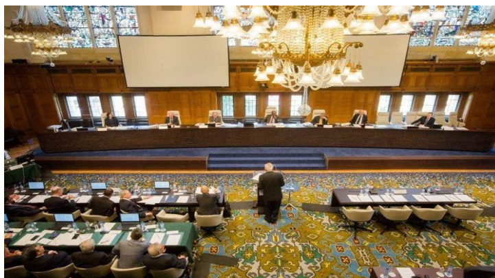
Figure 3. Permanent Court of Arbitration at the UN

The basis of China's territorial claims over nearly the entire waters of the South China Sea in fact has been broken by the United Nations (UN) decision in 2016. This started after Indonesia's neighboring country, the Philippines, filed a lawsuit at the International Arbitration Court or the Permanent Court of Arbitration (PCA), which is a legal institution under the United Nations. The PCA has made a decision regarding the dispute in the South China Sea submitted by the Philippines, even though China has firmly rejected the PCA's decision. In fact, from the start China rejected the Philippines' lawsuit, arguing that the lawsuit was a confrontational way to resolve disputes. China's absence at trial, as confirmed by the PCA, does not reduce PCA's jurisdiction over the case. Even though the lawsuit was filed with the PCA by the Philippines, the decision has implications for ASEAN countries which have so far been in dispute with China in the South China Sea. 19