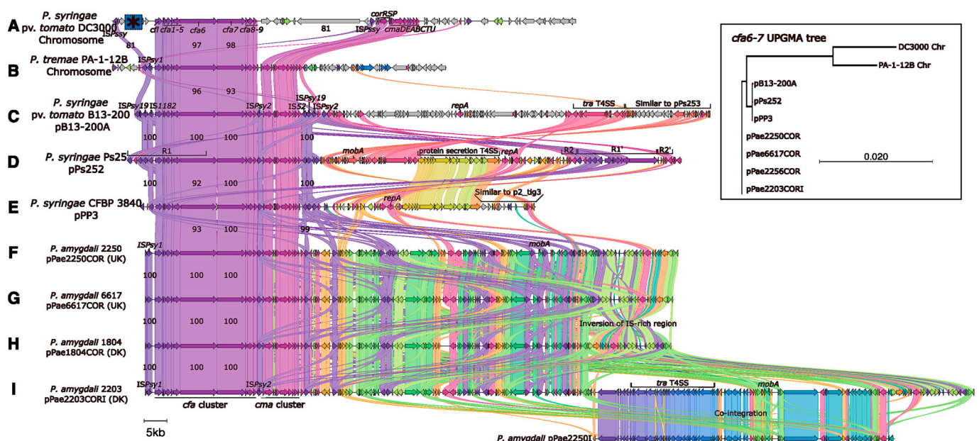
Fig. 3. Comparisons between coronatine genetic regions made with Clinker and annotated in InkScape. Only selected, relevant genes and features are annotated. Asterisk in P. syringae DC3000 chromosome sequence represents 29 ORFs that were removed to fit the sequence in the fig. A phylogenetic tree (insert) based on the cfa6-7 genes supports the order of sequences. The tree was constructed in CLC Genomics Workbench 22 (Qiagen, Aarhus, Denmark), using UPGMA algorithm and the Jukes-Cantor distance model.