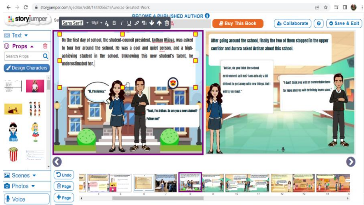
Figure 2. Inserting the text of the story

researchers used "Text" feature for creating chat balloons and selecting available text fonts, story text background colors, clear font sizes, and attractive writing colors.