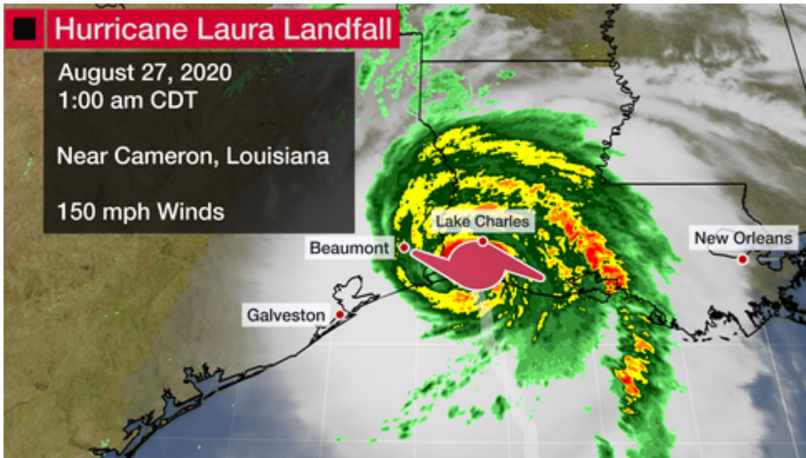
Figure 1.1 Hurricane Laura landfall location