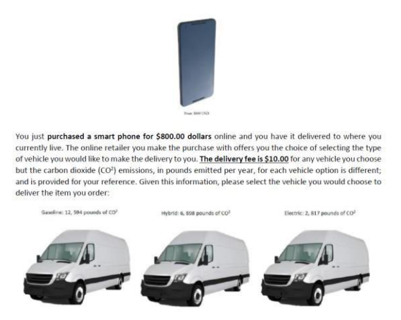
Figure 3. Example of Scenario in Experiment

In conducting the experiment, the 682 participants were randomly assigned to any of eighteen experimental scenarios – each scenario representing a unique mix of the factors under consideration: environmental knowledge, delivery fee, and product type. The survey through which the experiment was administered randomly assigned participants to one of these eighteen scenarios in a sequential manner, ensuring that participants were approximately evenly distributed across all scenarios. Figure 3. provides an example of one of the eighteen experimental scenarios utilized in the experiment.