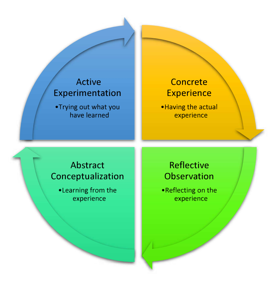
Figure 2. Illustration of Kolb's learning cycle adapted from Mcleod, 2013.

value industry-focused experience (Ozek, 2018). The learning intensifies after the concrete internship experience through reflective observation, abstract conceptualization, and active experimentation; these steps involve identifying areas where there are gaps between experience and understanding, considering new ideas that modify existing concepts, and applying new ideas to other experiences to see what results (Mcleod, 2013). Through active reflection, knowledge gained becomes internalized and can be applied in future opportunities. This cycle can be seen in Figure 2.