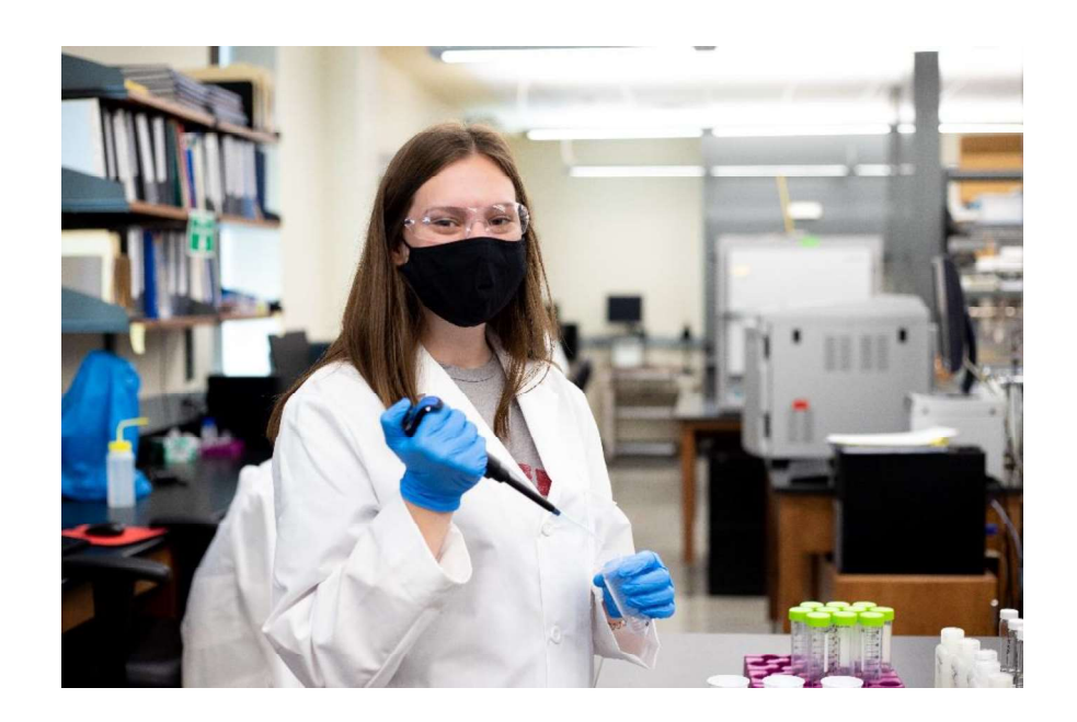
Figure 3. Me using a pipette in the AWRC water quality lab on April 30, 2021.

In this role, I learned the importance of quality control procedures, especially within organizations like the AWRC that provide lab services to the general public, who may rely on this information to inform public health and safety decisions. I also enjoyed the hands-on aspects of the job within the lab. I gained confidence in my ability to use lab equipment, including micropipettes, precision scales, a filter apparatus, personal protective equipment, and a drying oven, which translated to future lab courses, including General Microbiology (BIOL 2013) and University Chemistry II (CHEM 1123). However, some tasks became repetitive in my role, leading me to discover that I want to work in future roles that touch a wider range of tasks and projects.