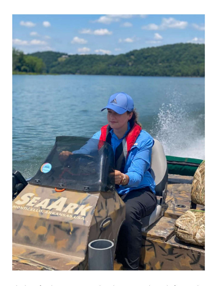
Figure 5. Me driving the boat for the environmental quality team at the end of a sample run on July 6, 2021.

The environmental team also collected a profile each week at the intake, taking samples every few meters down from the surface to the lake bottom. Through this process, I learned that lake water is not homogenous and changes significantly with depth because of lake stratification, which is when lakes thermally "divide" into different layers of water that do not mix. The top layer of water, called the epilimnion, is warmed constantly by the sun, decreasing its density, and keeping it afloat. The coldest, lowest layer of water is called the hypolimnion; it also contains the least dissolved oxygen since it does not interact with the surface, where oxygen is dissolved into water from the air and generated through