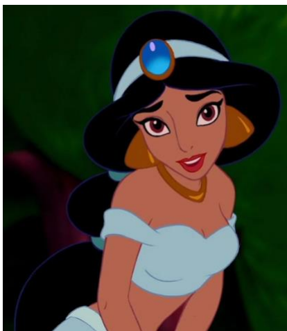
Figure 12: Princess Jasmine 61