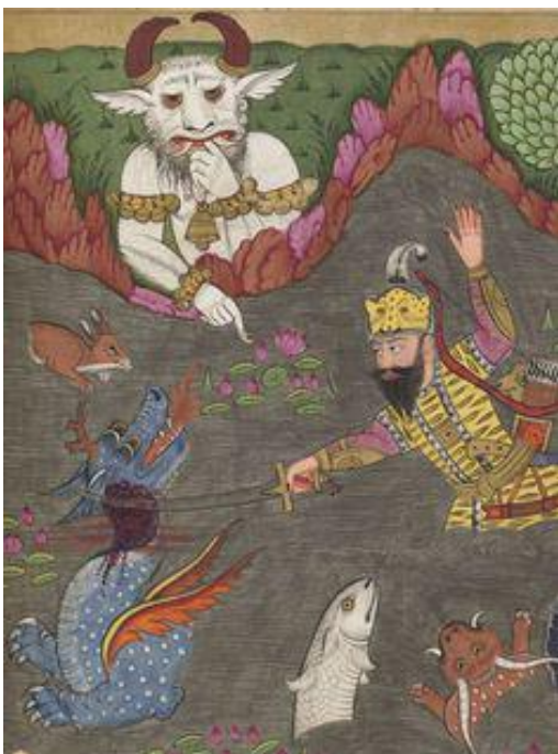
Figure 8: medieval Persian manuscript illustration 39