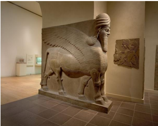
Figure 4: Bull bodied Lamassu 27