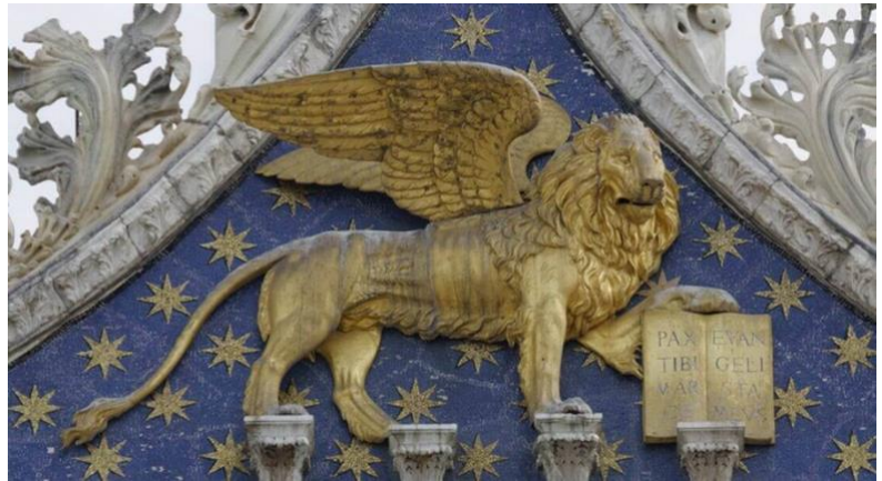
Figure 3: Venetian statue of Mark the Evangelist 26