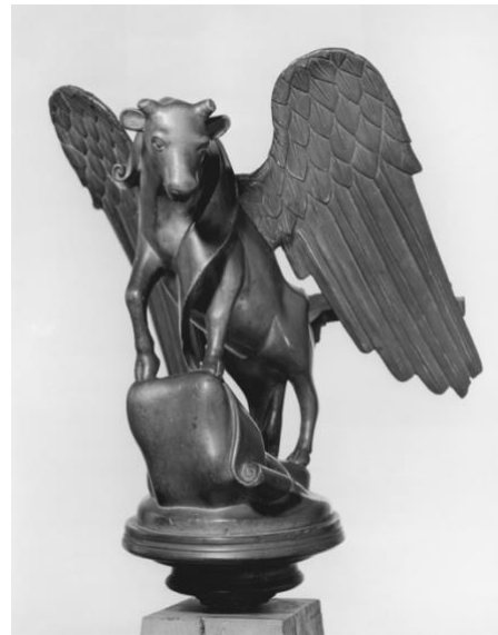
Figure 5: Medieval lectern statuette of Luke the Evangelist 28