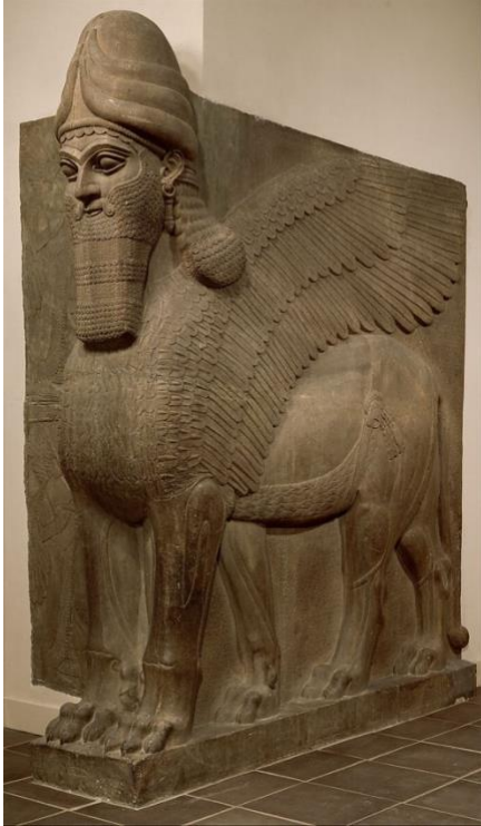
Figure 2: Lion bodied Lamassu 25