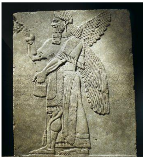
Figure 1: Assyrian relief of winged jinn 14

Sharrukin, c. 713 BCE, depicts a human man with wings who is believed to be one of these bird-like proto-jinn by modern scholars (see figure 1). 13