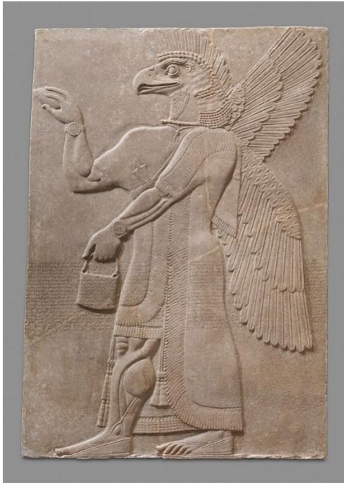
Figure 6: Mesopotamian eagle headed deity 29