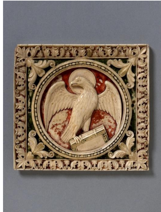
Figure 7: Italian carving of John the Evangelist 30

Our greatest source of written explanation of jinn comes from Islam, whose traditions codify their presence as a creation of God and formally name them “jinn”. Islam originated in Hira, near Mecca, when the Prophet Muhammad received his first revelation from an angel of God in 610 CE. 31 He began teaching these revelations three years later, with strong encouragement from his wife Khadījah bint Khuwaylid (خديجة), later to be known as Umm al-Mu'minīn (Mother of the Believers). The Prophet died in Mecca shortly thereafter, however, by