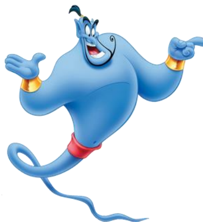
Figure 13: Genie 62