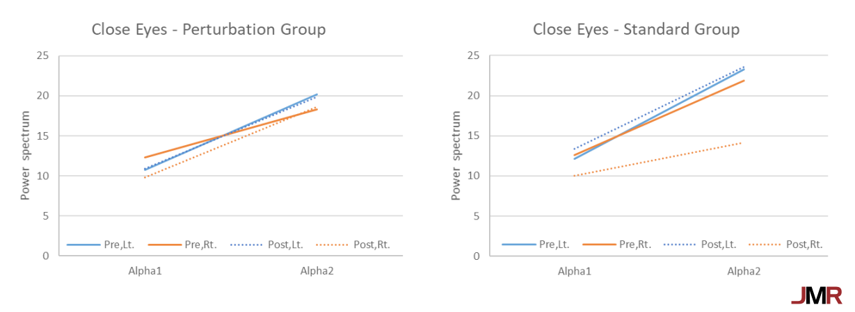
Figure 4. The perturbation training group did not change in the comparison of the pre- and post-tests and showed very good symmetry between two limbs in the post-test. The standard training group showed a considerable decrease only in the healthy limb, and in the post-test comparison, we found more asymmetry in alpha power spectrum between the two limbs. *Alpha1 (8-10 Hz) and Alpha2 (10-12 Hz).

Considering that the most effective treatment algorithm agreed upon for ACLDs athletes is "mechanical perturbation enhanced rehabilitation" [5, 25, 32, 37, 41-46], our main goal in this study was to optimize this type of treatment. In this study, to investigate the activity of the cerebral cortex before and after training, a mechanical perturbation device was designed and built by creating a perturbation in all movement axes to simulate similar events in the real world in more realistic acceleration and speeds. In comparing the present study with previous studies in the field of perturbation interventions, it can