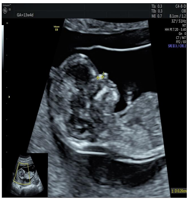
Figure 1. Ultrasound imaging measurement of NBL with calipers in the out-to-out position.

(underline) and the skin overlying it (top line), and the distal line showing the skin arriving at the end of the nose. Each increase in the distance among the calipers was 0.1 mm. The NBL was calculated by accommodating the calipers in the out-to-out position (Figure 1).