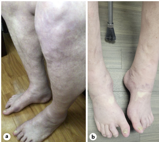
Fig. 1. a Lower extremity peripheral edema as a symptom of RS3PE after immune checkpoint inhibitor therapy and elective hip replacement surgery. b Interval improvement in lower extremity peripheral edema after 2 months of prednisone therapy.

resulted in rapid improvement in his weakness, joint pain, and peripheral edema. Blood collection was repeated after 2 weeks of steroids which revealed improving inflammatory markers (CRP 44.9 mg/L from 183 mg/L, ESR 65 mm/h from 113 mm/h) and hypoalbuminemia (36 g/L from 28 g/L). He was able to discontinue midodrine, fludrocortisone, and furosemide without recurrent symptoms. After 4 months of follow-up, the patient was reported to be continuing a steroid taper with a transition to methotrexate underway. He endorsed mild residual ankle swelling and joint discomfort but was otherwise working to return to his functional baseline (Fig. 1b, 2).