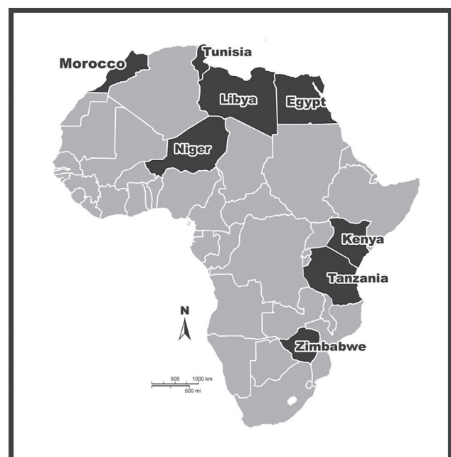
Figure 3. Africa abelisauroid record distribution from Late Jurassic to Late Cretaceous, ages from Cohen et al. (2020).

?Abelisauridae indet (Janensch, 1925) – MB R 3626 is a well preserved right tibia from the TL locality of the