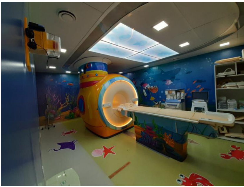
Figure 3. Magnetic Resonance Imaging equipment.