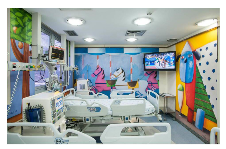
Figure 2. Aspect of the hemodialysis unit.