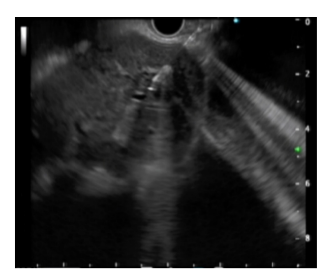
Figure 1. Ultrasound endoscopically guided intrahepatic bile duct puncture.

Intraoperative operating: EUS-AG group: ultrasound endoscopy was placed in the stomach to find the dilated intrahepatic bile ducts. Three segments of intrahepatic bile ducts with a dilated diameter greater than