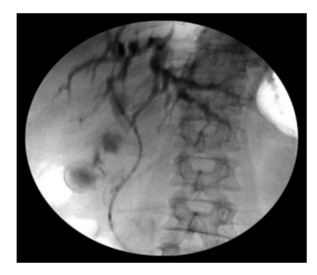
Figure 3. Guide wire placement and anterograde passage through the bile duct stricture.

Postoperative management: Patients were fasting, and electrocardio was monitored for 24–48h after operation; Use proton pump inhibitor to suppress acid and protect stomach; Blood routine examination, blood amylase, liver function, and other related indicators were performed again at 24h; Closely monitor vital signs of patients.