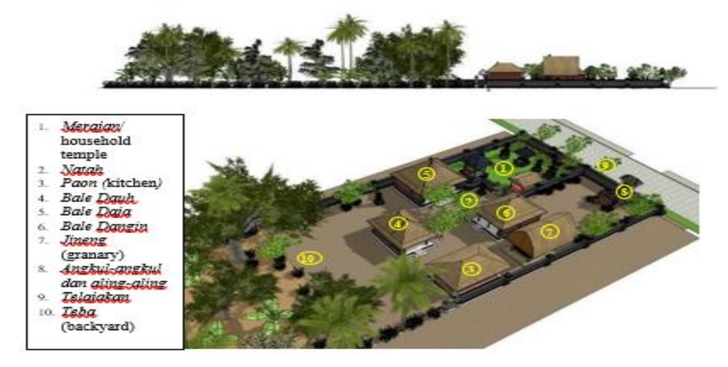
Figure 1. The layout of a traditional Balinese house

Regarding layout, natah serves as a focal point for information exchange between pavilions. On a spiritual level, it serves as a focal point for ceremonies that connect the earthly plane to the higher and lower spheres. Aside from natah , the existing pavilions are used for rituals. Pavilions can also include a kitchen ( paon ), storage ( bale meten ), pantry ( jineng or klumpu ), and a dining area ( bale dauh ) (Figure 1). The bale dangin is oriented eastward. This structure is called bale adat , a religious ceremony pavilion. Travelling in the direction of kaja will lead people to bale meten (north for the people of South Bali). There are jineng or klumpu , rice storage pavilions, and also bale dauh in the west. The bale delod is a social and religious gathering place in some traditional homes. Teba is an essential component of a traditional house, serving as a location for food cultivation and animal husbandry. Pigs, chickens, ducks, and cows can be kept there, as well as coconut trees, banana trees, bamboo, and a wide variety of flowers. All of the animals mentioned above and plants are associated with providing various building materials for ritual spaces and satisfying the inhabitants' basic needs.