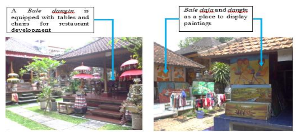
Figure 2. The transformed model layout of a traditional Balinese house

The traditional functions of several ceremonial spaces have shifted as a result of their economic value. Many renovated Ubud houses now include tourist amenities, allowing visitors to look at Ubud's traditional architecture firsthand. A bale dangin can be added to a café, gallery, or bed and breakfast (Figure 2). Natahs are now popular tourist destinations. These renovated properties now include new amenities, cultural demonstrations, and structures in the traditional Balinese style for the benefit of visiting tourists. This pattern demonstrates how the tourism industry has infiltrated private domestic havens. The domestic sphere, once considered private, is now open to public and economic actors.