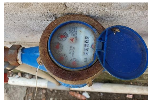
Figure 5. Clean water distribution meter (Observation, 2021)

The results of the Mann Whitney U-Test in Table 13 state that the value (p) = 1.000 (p > 0.05) means that there is no significant difference. Therefore, there is no difference between the equitable distribution of clean water in the two villages. Most respondents in Pasirsari Village and Mekarsari Village agreed as much as 100%. This data is supported by the results of interviews in Pasirsari Village that the distribution is even to all beneficiaries, as many as 47 heads of families (KK) who are still actively distributing clean water to this day through water pipes to the facilities. Meanwhile, interviews with some residents in Mekarsari Village indicated that the distribution was evenly distributed to all beneficiaries in around 16 houses with an average usage of up to 7 or 8 cubic meters at the cost of around 25 thousand to 30 thousand. In addition, there are infiltration wells that can collect rainwater and can be reused for daily needs. (V)