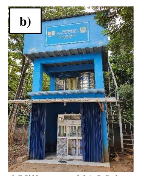
Figure 4. Well maintained quality in a) Pasirsari Village and b) Mekarsari Village (Observation, 2021)