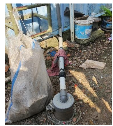
Figure 3. Piped water to the reservoir (Observation, 2021)

According to the results of the Mann Whitney U-Test in Table 7, the value (p) = 0.632 (p > 0.05) means that there is no significant difference. Therefore, there is no difference between the adequacy of clean water supply in the two villages. Most respondents in Pasirsari Village agreed, as much as 90%, and interviews support the data that clean water has covered all beneficiaries of 30 heads of families. Most residents feel that their need for clean water is sufficient and suitable for consumption. Residents need around 9-10 cubic meters of water for one head of household. Water sources have been obtained through excavations around 50 to 90 meters below ground level. Meanwhile, most Mekarsari Village respondents agreed as much as 87.1%. The data is supported by interviews that residents feel that their clean water needs are fulfilled. Some residents use SAB as a backup, with the jet pump as the primary source. There is a resident who prefers SAB because it is more affordable than using PDAM. Moreover, Mekarsari Village is located in the Groundwater Basin (CAT) area, so the water flows more swiftly.