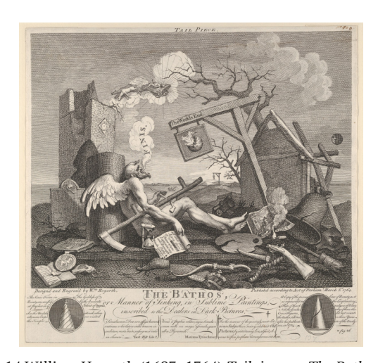
Fig. 14 William Hogarth (1697–1764) Tailpiece, or The Bathos etching with engraving, 1764, on laid paper. Public Domain.

Bourdieu describes rather than prescribes even as he summarises this 'slow renunciation.' In his film, Greenaway overskips contemplation of ageing per se (there is no greater taboo than depicting age, as Adorno argues using the example of the shop girl and "the old woman who weeps at the wedding services of others, blissfully becoming aware of the wretchedness of her own life"),<sup>63</sup> chronicling aspects of death and decay (film is an ideal medium for this as Greenaway does in his 1985 Zed and Two Noughts ).<sup>64</sup>