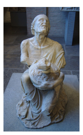
Fig. 11a Die trunkene Alte (1 C. CE Roman copy of a Greek original, 3-2 C. BCE Glyptothek, Munich. Photograph: Saint Pol, April 2007. Public Domain.

One may contrast this depiction of Stoic ageing of old men (Figs 10a and b), specifically the sage, with that of old women in various poses of unrestraint which also match the depiction of Baubo and Iambe,<sup>51</sup> although Iambe is not always emphasised with respect to her age, but similarly featured in The Hymn to Demeter (190–205), where Demeter herself, as already noted earlier in this essay, appears in the disguise of an old woman. To this extent, we may also need, borrowing a bit from the hermeneutico-phenomenological method, to 'bracket' our own sensibilities with respect to these statues — and there are several