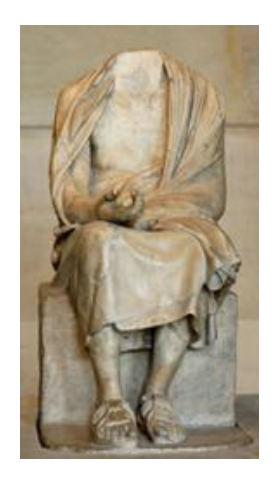
Fig. 10b Vieillard assis. 2nd Century CE. Louvre, Paris. Photograph: Jastrow. Public Domain.

One may contrast this depiction of Stoic ageing of old men (Figs 10a and b), specifically the sage, with that of old women in various poses of unrestraint which also match the depiction of Baubo and Iambe,<sup>51</sup> although Iambe is not always emphasised with respect to her age, but similarly featured in The Hymn to Demeter (190–205), where Demeter herself, as already noted earlier in this essay, appears in the disguise of an old woman. To this extent, we may also need, borrowing a bit from the hermeneutico-phenomenological method, to 'bracket' our own sensibilities with respect to these statues — and there are several