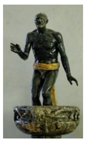
Fig. 10a Sénèque mourant, 2nd Century CE. Louvre, Paris. Public Domain.