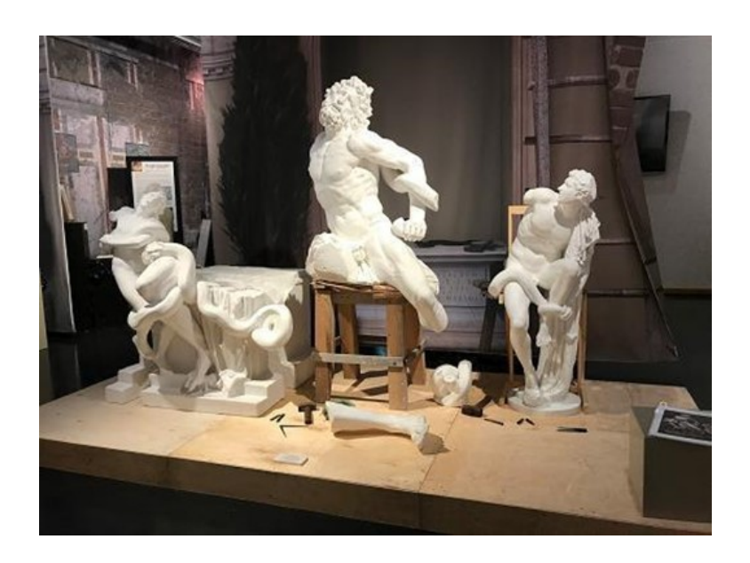
Fig. 8. Laokoon in der Antike. Laocoon reset. Humboldt University Berlin. May 2017.

Excavated, the Laocoon is in pieces. At issue is the question of how to 'reset' or put the Laocoon together again — see Fig. 8 for a recently 'curated' depiction of the original find.<sup>43</sup> The happenstance that Michelangelo was present made all the difference in the initial restoration quite apart from any questions of ageing or 'faking' statues.