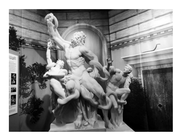
Fig. 7. Laokoon in der Antike. Laocoon reset. Humboldt University Berlin. May 2017.