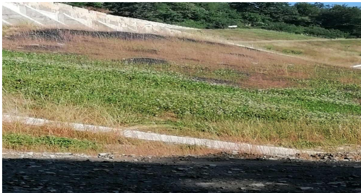
Figure 3. Section of highway E-75, Corridor 10, Gornje polje-Caričina dolina, Hydroseeding

Ćirić (1991) and Filipovski (1999) point out that the mechanical composition of soil is of great importance for all other properties, and in the first place for plasticity, swelling, stickiness and stability of structural soil aggregates. The high content of clay and colloids, together with their hydrophilic character, and the large presence of clay minerals of the montmorillonite group with a very low content of sand, is the cause of unfavourable physical, water, air and physical-mechanical properties of the soil.