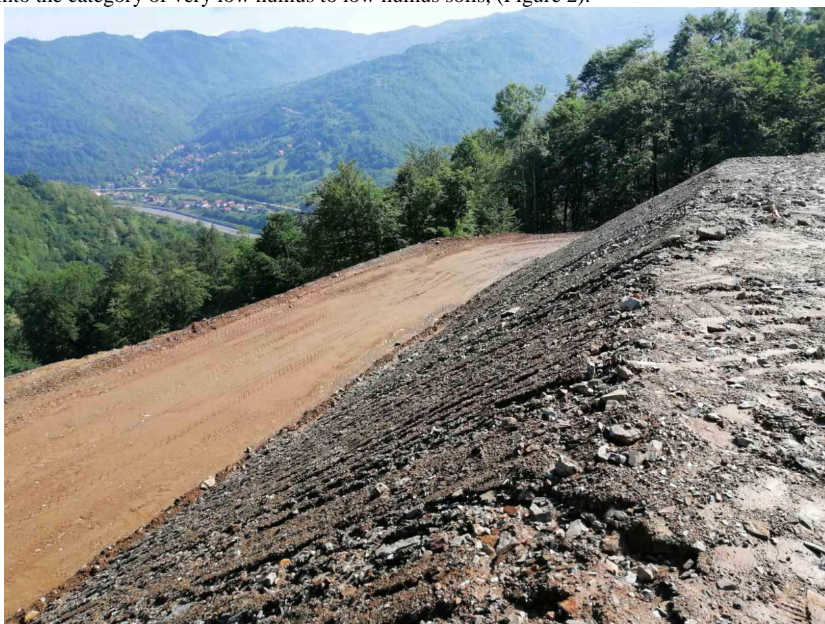
Figure 2. Section of highway E-75, Corridor 10, Gornje polje-Caričina dolina, Decade IV

The results of the analyzes in Table 1 show that the tested samples have a very low content of humus and total nitrogen, which, according to the classification of Gračanin, fall into the category of very low humus to low humus soils, (Figure 2).