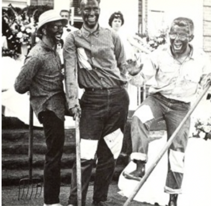
Figure 3. Olive Leaves [1963] 69