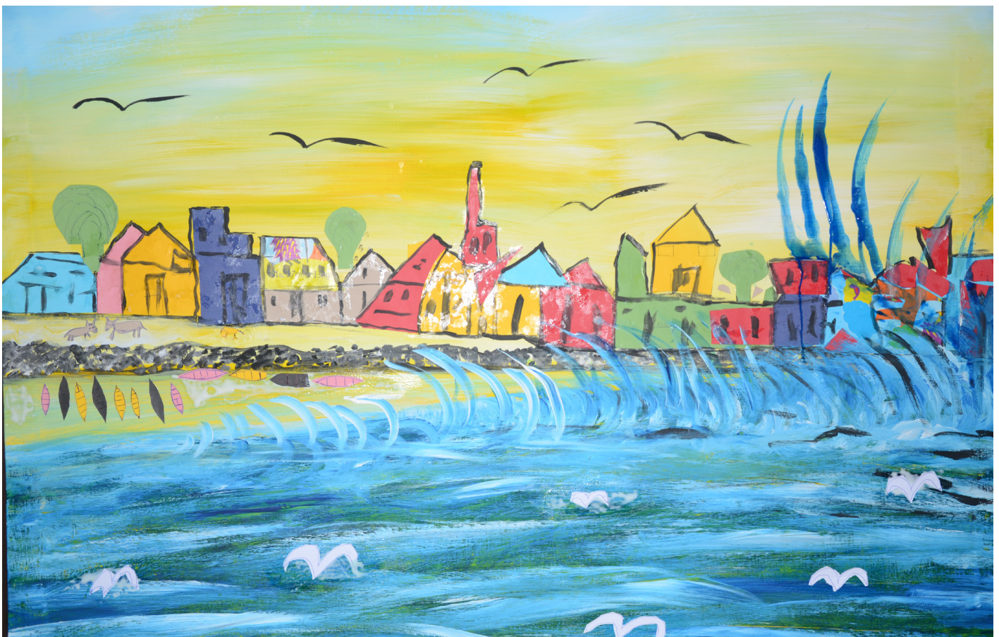
Source: A painting about sea level rise created by workshop participants in Senegal, facilitated by Samba Sarr.

Workshop participants believed they were taking part in the types of activities recorded in the 'arts-for-change' literature