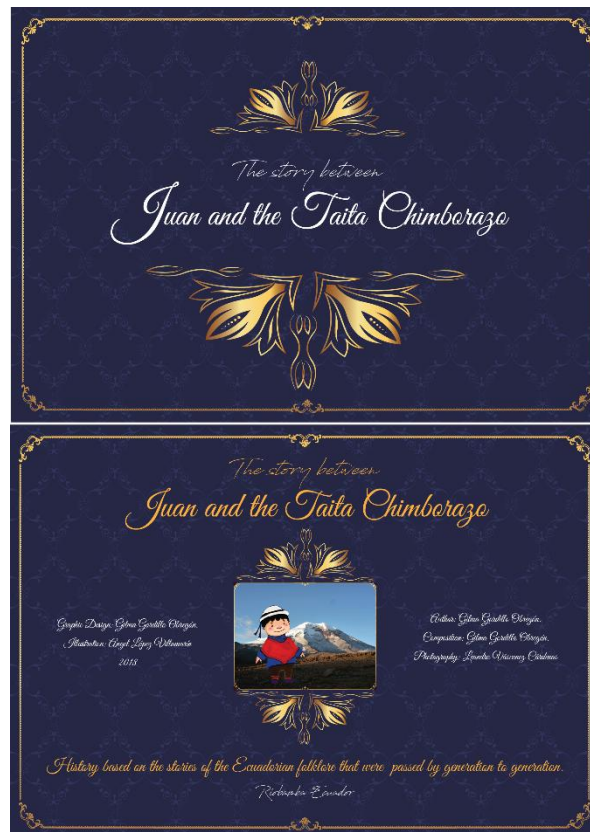
Figure 2. The Story between Juan and the Taita Chimborazo