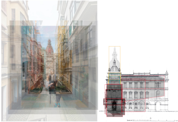
Figure 3: [left] Overlapping of photographs located at two distances from the town hall on the same street, drawing and editing, Ledo Romay, 2021; [right] Overlapping of cropped photographs on the east elevation of the A Coruña City Hall, where the colors of the frames identify the distance of each photograph, Ledo Romay, 2021.