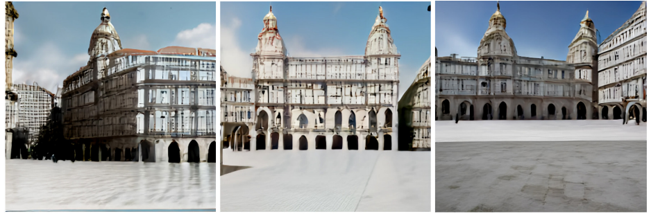
Figure 7: Images generated with Craiyon AI on María Pita Square, the authors, 2022.