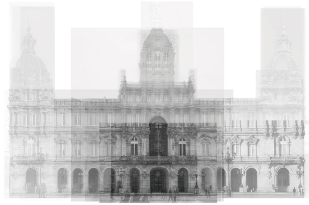
Figure 4: Greyscale orthoimage of the collective vision of the facade of the town hall square in A Coruña, Ledo Romay, 2021.

be formally related to the method developed by the Swiss photographer Corinne Vionnet, who, in her research Photo Opportunities (Vionnet, 2011), uses tourist images obtained from the Internet applying overlapping strategies, finally obtaining results that condense the collective visual memory of the place (Luna Lozano and Martín Martínez, 2022).