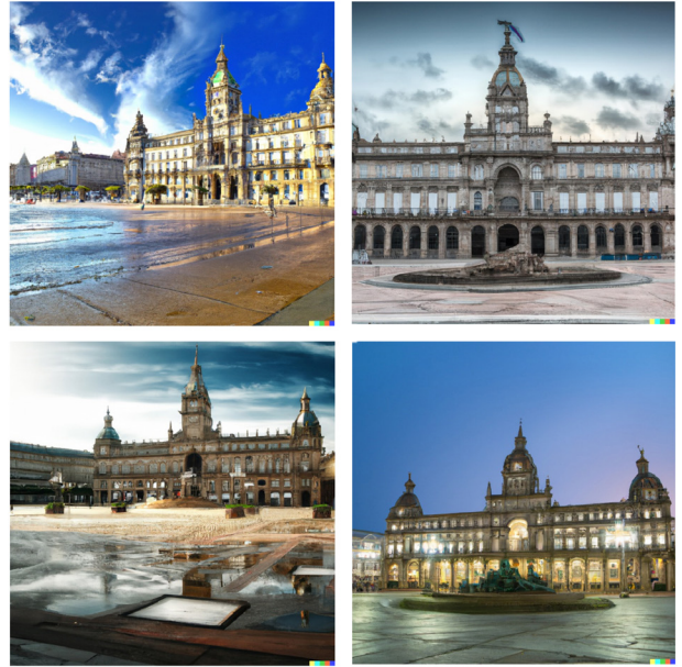
Figure 8: Images generated with Dall-e AI on María Pita Square, the authors, 2022.

from users they follow, so communicating ideas through related images is not the nature or purpose of the platform.