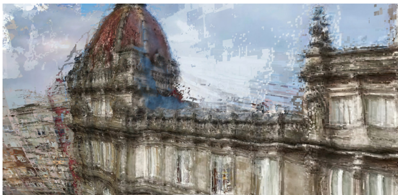
Figure 5: Zoom on the mesh to visualize the artistic character of the collective memory generated by photogrammetry technology, the authors, 2022.