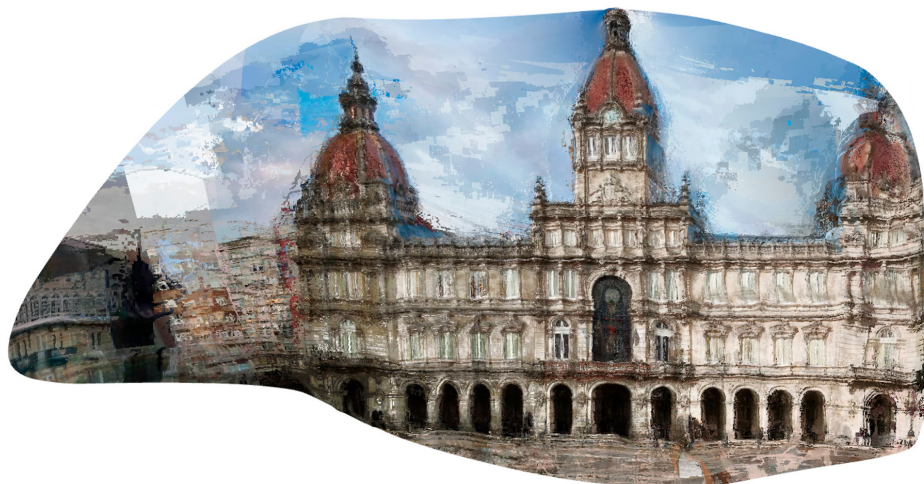
Figure 6: Orthoimage of the mesh on the collective vision of the facade of the town hall square in A Coruña using photogrammetry techniques in the Autodesk Recap Photo software, the authors, 2022.