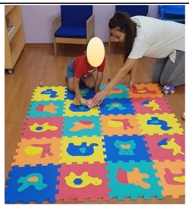
Photo 1: A child and a teacher are working through a task on the puzzle mat