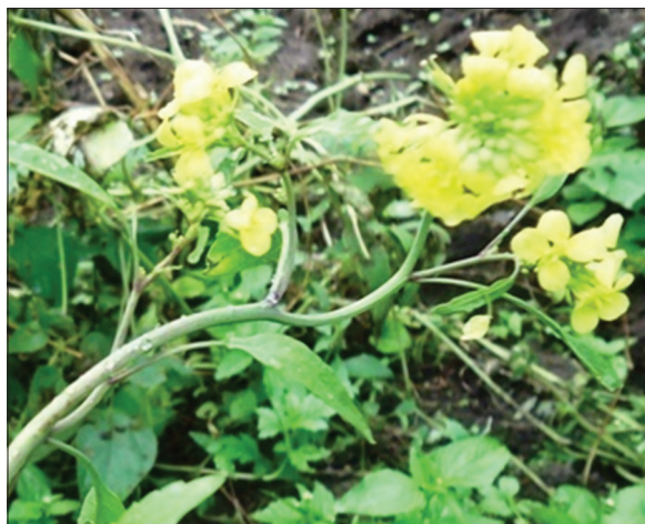
Figure 1: B. nigra L. Koch (Brassicaceae) were collected from Yerer Lencho locality of Akaki District

extract of B. nigra exhibited potent mosquitocidal activities against Anopheles arabiensis (Bekele & Petros, 2017).