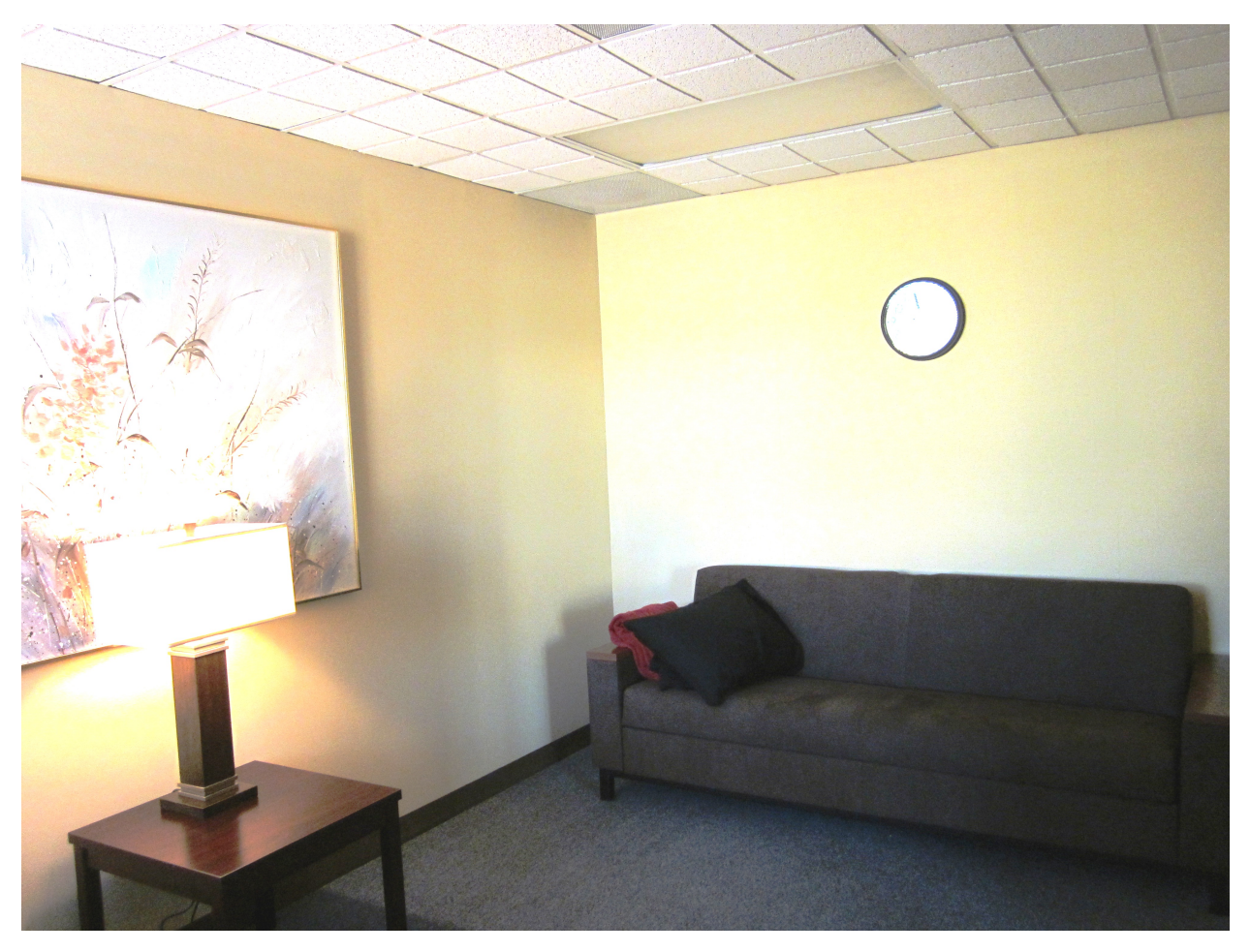
Image 1. R and R Room: The rest and relaxation room where guests can have added privacy or relax alone if necessary.