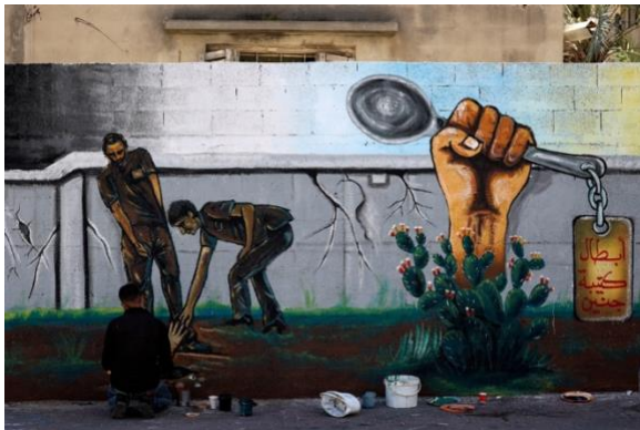
Image 3: An artist in Gaza City works on a mural glorifying six Palestinian prisoners who escaped from Israel's Gilboa prison. This is a continuous struggle. Our struggle is a metaphysical resistance and this image is the actual physical