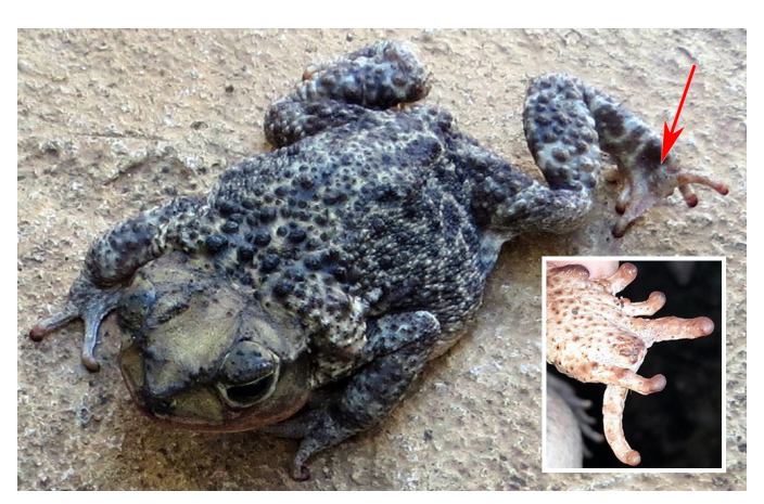
Figure 4. Possible taumely of the fourth toe of a female Zapata Toad ( Peltophryne florentinoi ) from "The Toad Farm" near Jagueycito, Nueva Paz, Mayabeque Province, Cuba.

The adult female had a deformity on her right hindlimb (Fig. 4). Based on the nomenclature of Henle et al. (2017), the observed abnormality could be considered a type of taumely, taking into account that, although this is not a long bone out of alignment, the degree of misalignment of the fourth toe of the hindlimb is suggestive of the term. This type of abnormality has not been documented previously for this species. Alonso Bosch et al. (2021) reported externally visible skeletal abnormalities in P. florentinoi from Playa Girón and Guasasas in the Zapata Swamp, noting that 13 adults of both sexes had one or more abnormalities. At least six types of abnormalities in fore- and hindlimbs were identified, but brachydactyly was the most frequently observed. The causes of those abnormalities remain unknown, although physicochemical and biological stress factors affecting the small population of Zapata Toads might be responsible. These are, however, restricted to a few localities associated with coastal forests with various levels of human perturbation. Further studies are