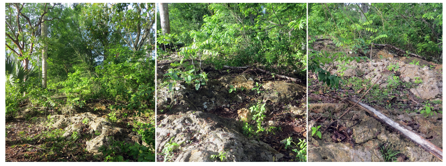
Figure 3. Habitat of the Zapata Toad ( Peltophryne florentinoi) near Jagueycito, Nueva Paz, Mayabeque Province, Cuba: Secondary vegetation and forest patches (left) and the karstic substrate that characterizes the area (center and right).

the toads is outside the nearby protected area, Refugio Fauna Sureste del Inglés. This area in the extreme southeast of Mayabeque Province forms part of the speleolacustrine zone of Cuba, bordered to the south by Ensenada de la Broa, to the east by the San Agustín or La Cocodrila Canal, which