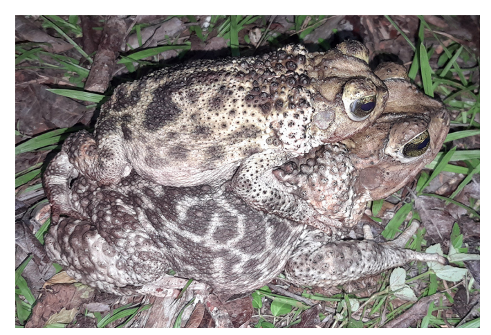
Figure 1. Amplectant pair of Zapata Toads ( Peltophryne florentinoi ) at "The Toad Farm" near Jagueycito, Nueva Paz, Mayabeque Province, Cuba.

On 13 January 2023, we conducted a rapid survey with the goal of completing an inventory of the terrestrial fauna of Playa Caimito, a locality partially in the protected area, Refugio Fauna Sureste del Inglés, with a total surface area of 12,470 ha (11,414 ha terrestrial and 1,056 ha marine), in Nueva Paz, Mayabeque Province. We generated lists of mammals, birds, reptiles, and also of some conspicuous groups of invertebrates such as butterflies and snails. Unfortunately, the meteorological conditions were not favorable for amphibian activity, although we noticed the presence of some species of frogs in the genus Eleutherodactylus , the Cuban Treefrog ( Osteopilus septentrionalis ), the introduced American Bullfrog