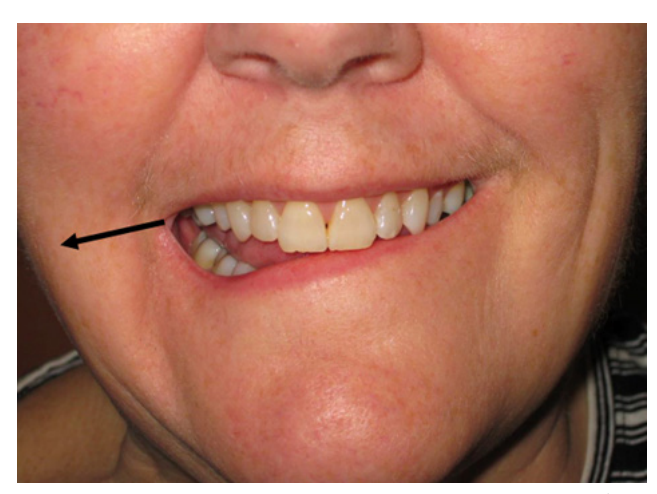
Figure 1: Left lower facial weakness, most likely explained by lack of Buccal nerve innervation to the Depressor Labii Inferioris