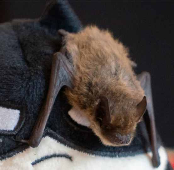
Figure 1: Pictures of some individuals of recorded bat species in Ukraine: a – Pl. austriacus , Kharkiv city, February 9, 2019; b - P. pygmaeus , Kharkiv city, January 19, 2021; c - H. savii , Uzhhorod city, February 9, 2020.