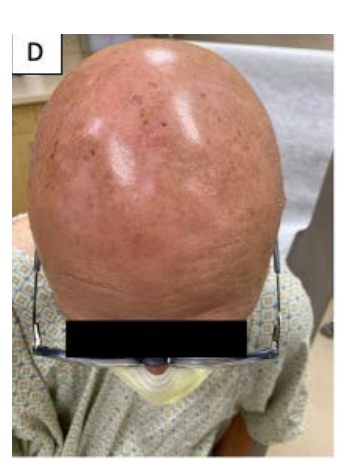
Figure 1: A, B. Scattered red scaly thin papules on the frontal and mid scalp. C, D. Frontal and mid scalp clear of lesions after a short course of topical steroid treatment.