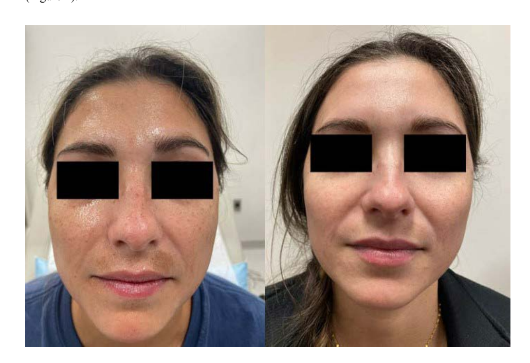
Figure 1: Before and After Laser-Assisted Delivery of TCA

https://doi.org/10.32873/unmc.dc.gmerj.5.1.067