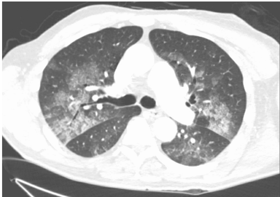
FIGURE 2: Ground glass opacities in Chest CT

The patient reported persistent shortness of breath and remained hypoxic. He was subsequently transferred to the pulmonology medical service for further treatment.