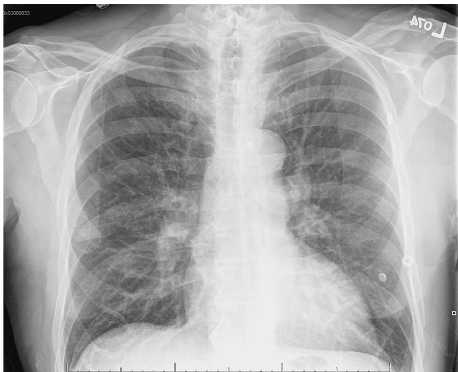
FIGURE 3: Final Chest X-Ray.

The patient remained on supplemental oxygen via nasal cannula at 2L/min over 24 hours; oxygen saturation remained above 96% over this period. His vital signs were unremarkable, and he reported improvement in his symptoms. On the second day of hospitalization, a repeat chest X-ray was obtained, which showed significant improvement in the bilateral airspace opacities with mild persistence prominence of the interstitium, suggesting resolving pulmonary edema (Figure 3).